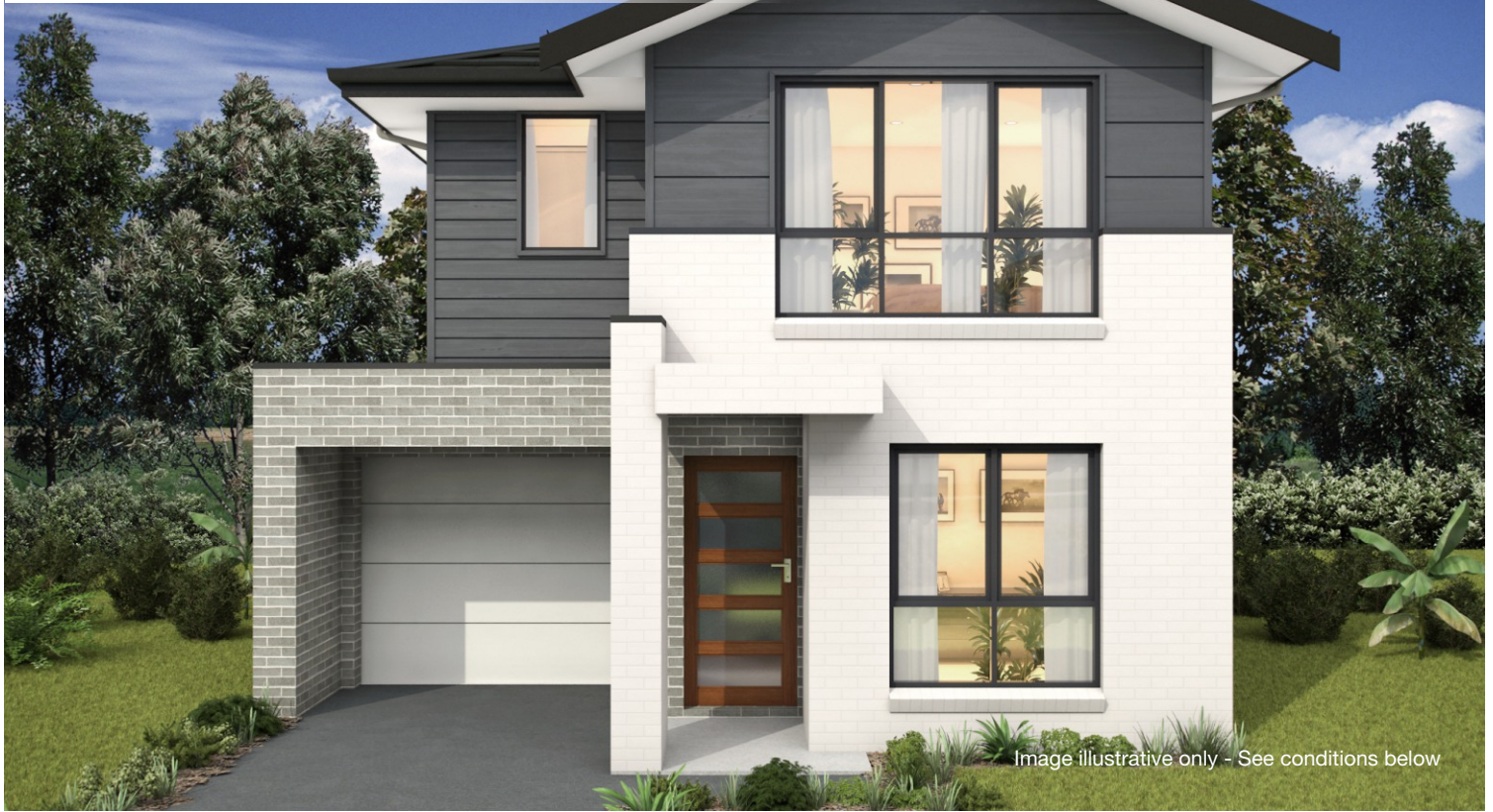
Image illustrative only - See conditions below