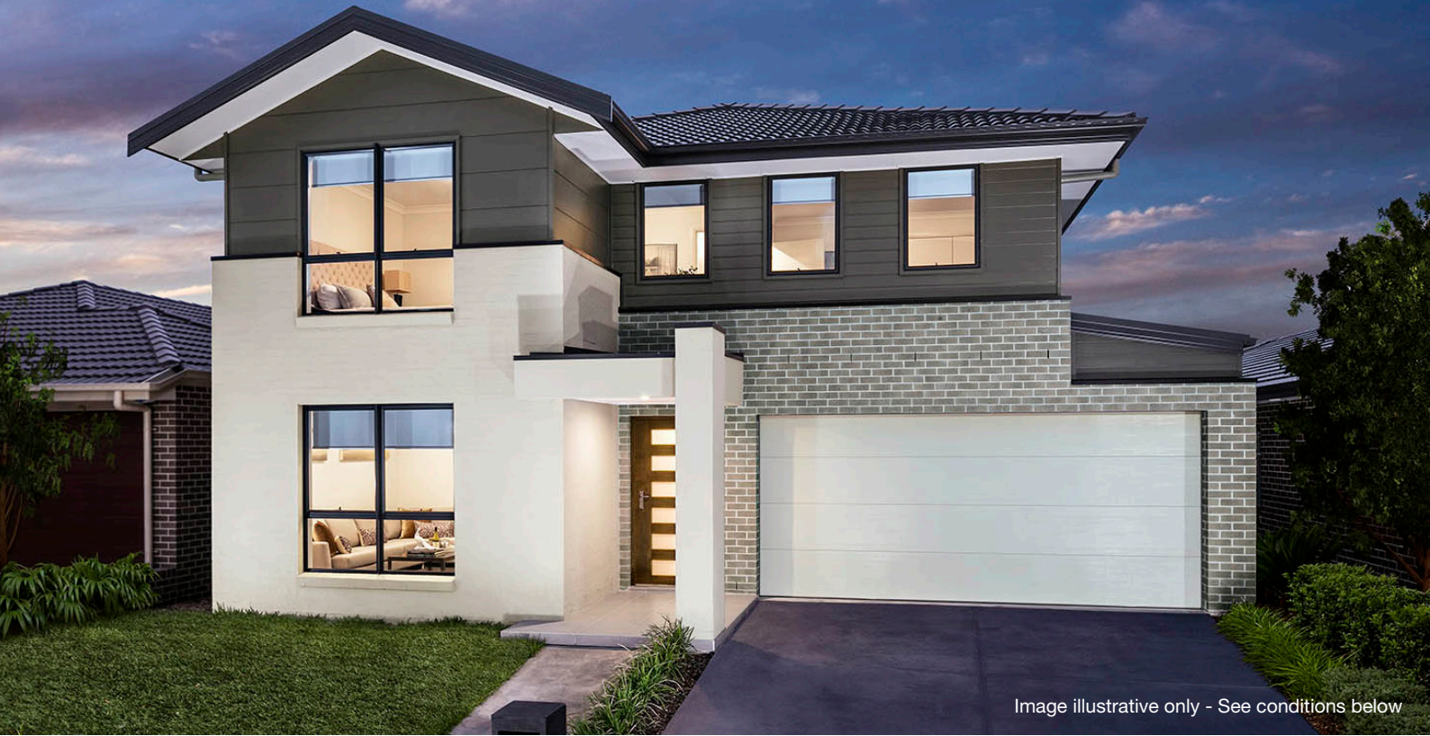
Image illustrative only - See conditions below