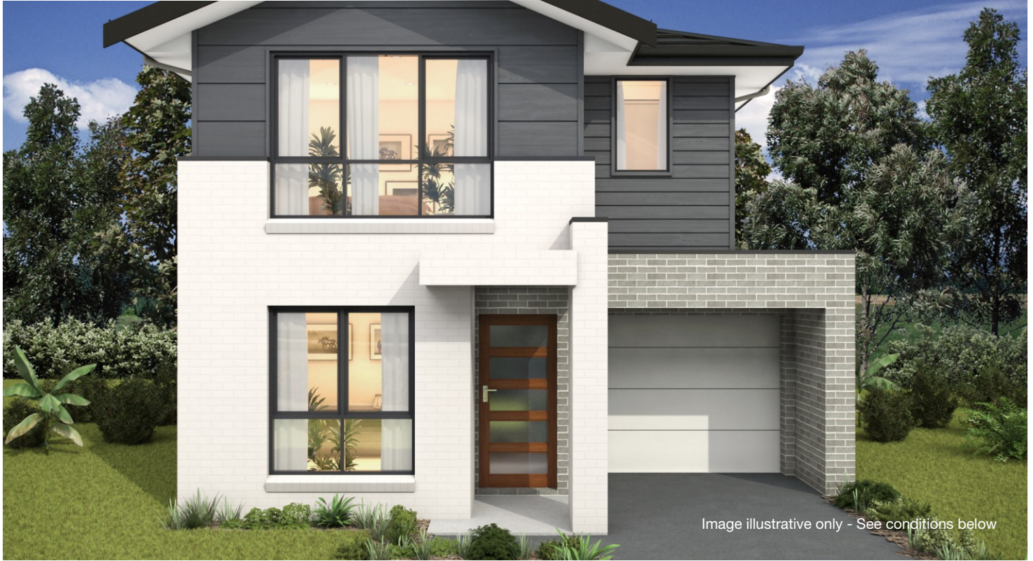
Image illustrative only - See conditions below