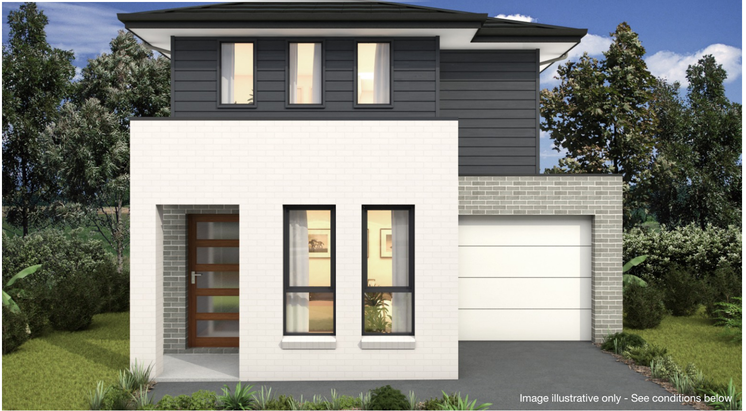
Image illustrative only - See conditions below