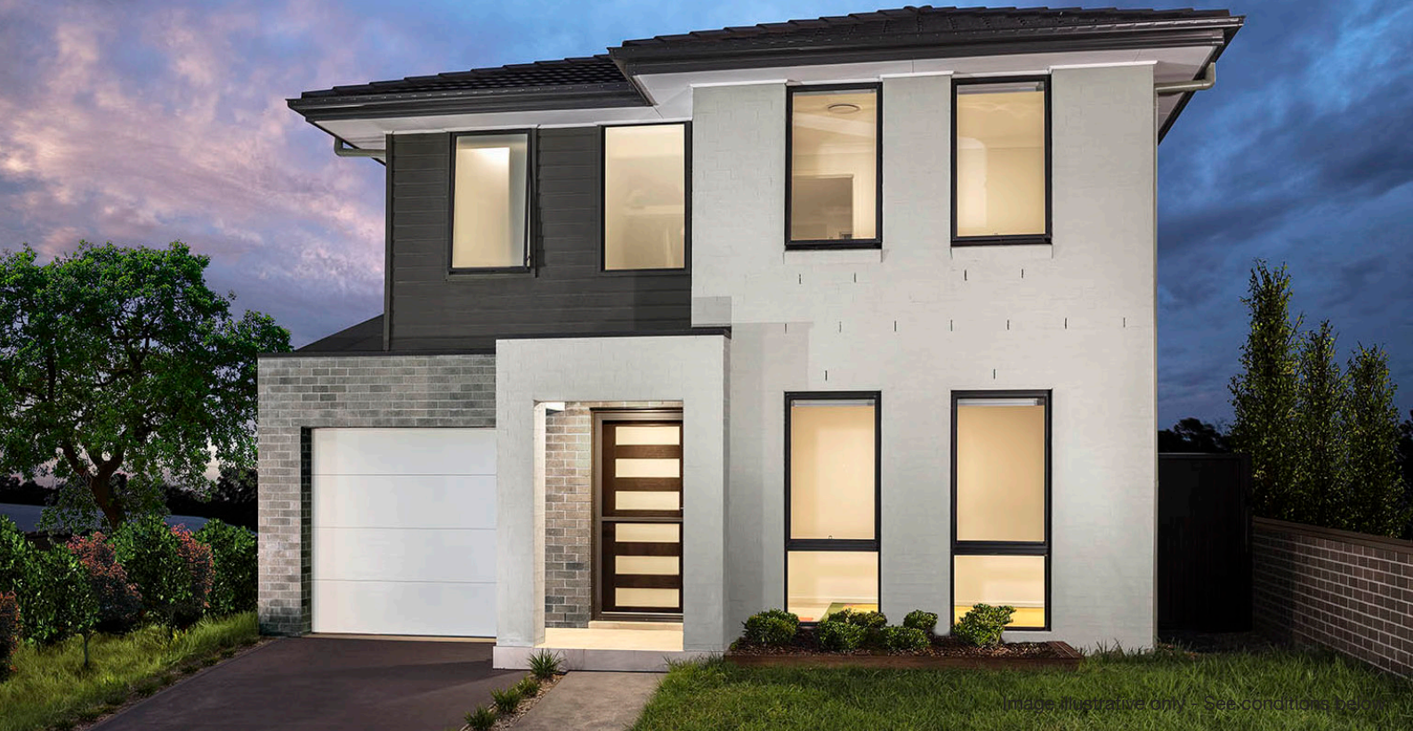
Image illustrative only - see conditions of sale

Harvey Exclusive with Traditional Facade