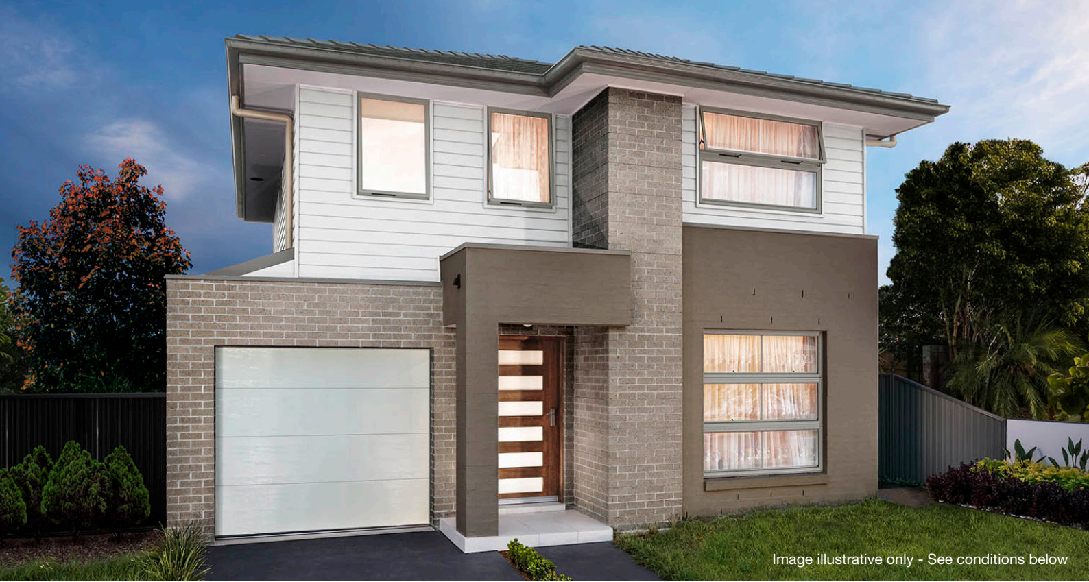
Image illustrative only - See conditions below